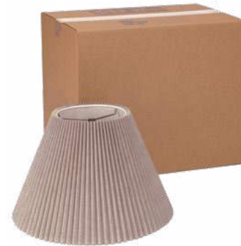
4.5-cubic-foot box 24" x 18" x 18"

A medium-sized box can be used for pots and pans, toys and small appliances.