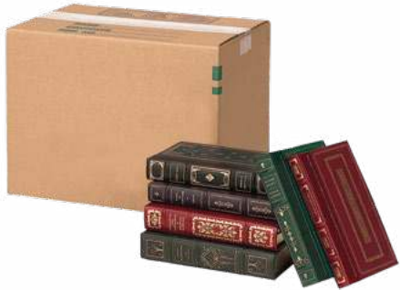
1.5-cubic-foot box 16" x 12" x 12"

This small box is ideal for heavier items such as books, records, CDs and canned goods.