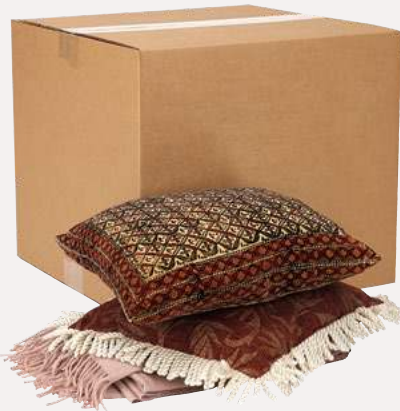
6.0-cubic-foot box 23" x 23" x 20"

This is an extra sturdy box for fragile items including dishes, china, crystal and glassware. Box dividers are available to provide additional protection.