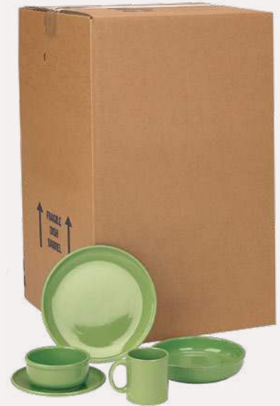
Dishpack 18" x 18" x 28"

This box is ideal for items such as lampshades, board games and linens.