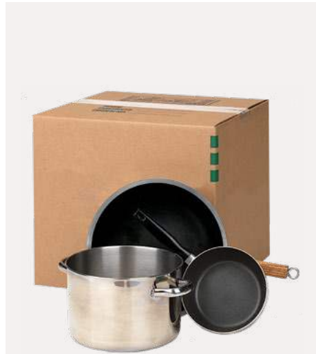
3.0-cubic-foot box 18" x 18" x 16"

This small box is ideal for heavier items such as books, records, CDs and canned goods.