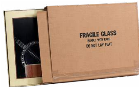
Mirror/picture box 40" x 60" or 30" x 40"

A large box should be used for lightweight, bulky items such as large pillows, down comforters and blankets.